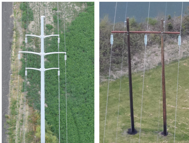
(LEFT) Double-circuit steel pole structure (RIGHT) H-frame wood pole structure