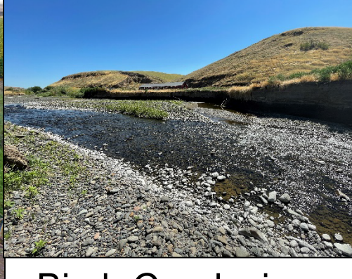
Birch Creek view south from Taylor Lane Bridge