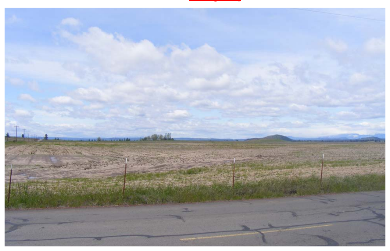
Figure 2-29. View from Knight Road near proposed Knight Substation sites (looking southwest)