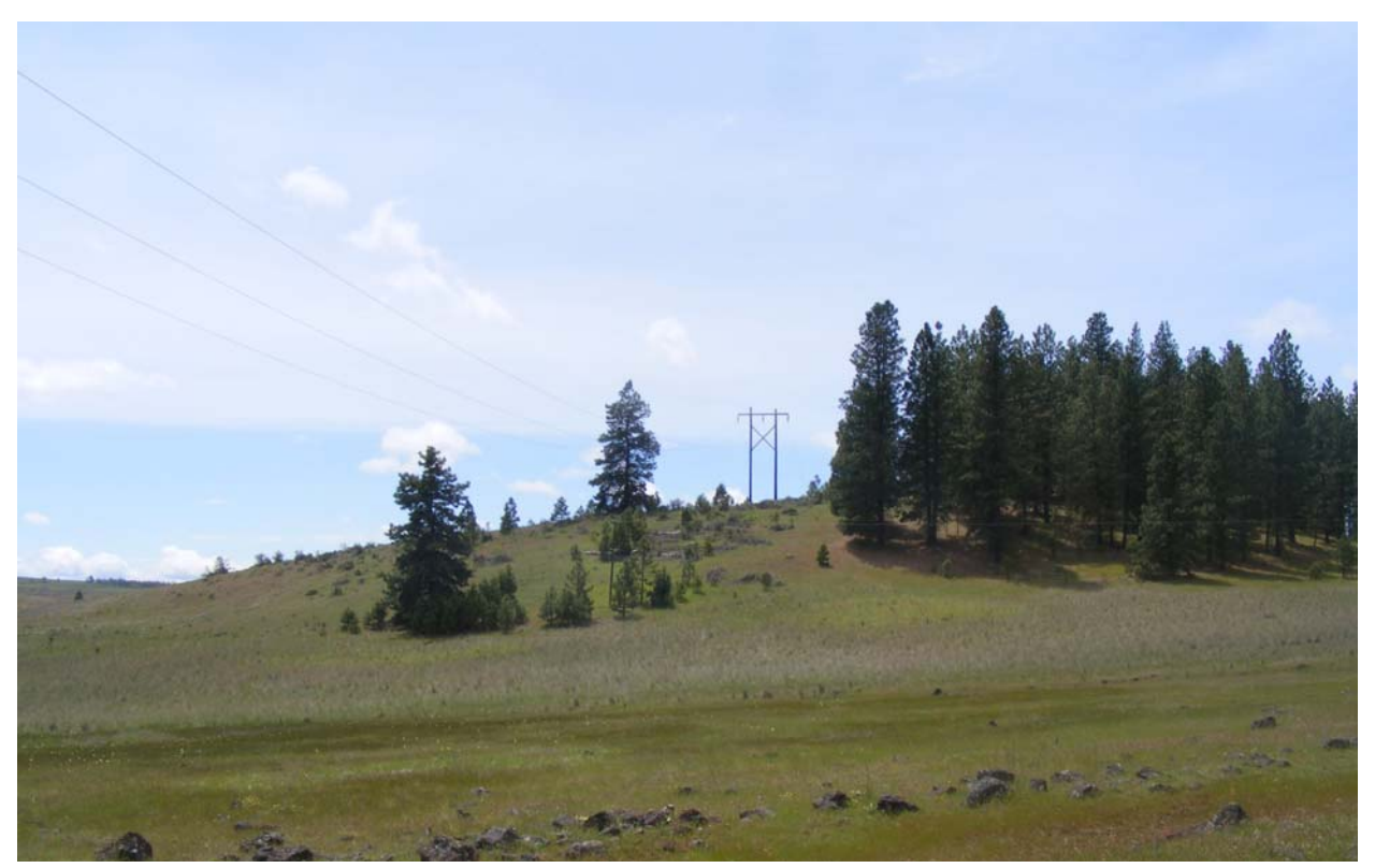
Figure 2-32. View from Olson Road (near M20/W20, looking southwest)