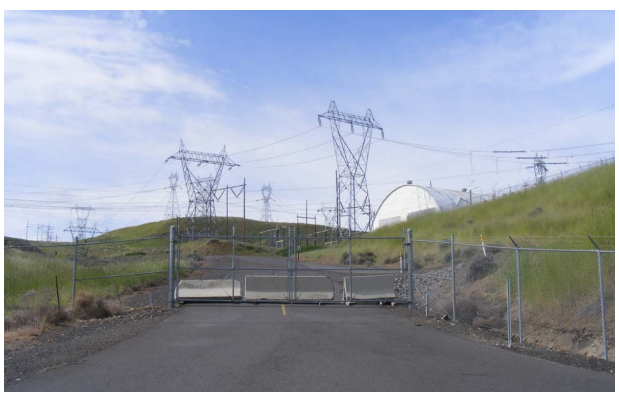
Figure 2-20. View of Big Eddy Substation from Columbia View Drive (looking south)