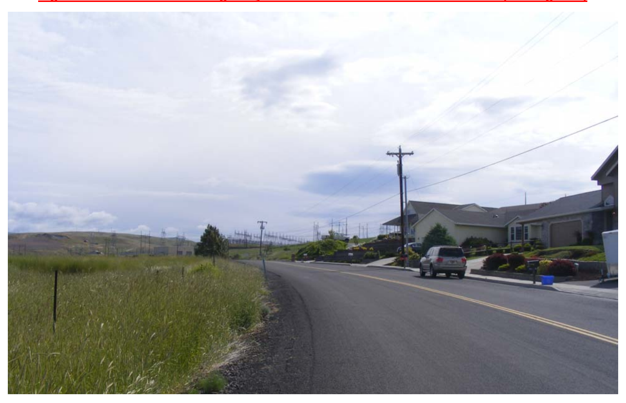
Figure 2-19. View of Entrance to Big Eddy Substation (looking east)