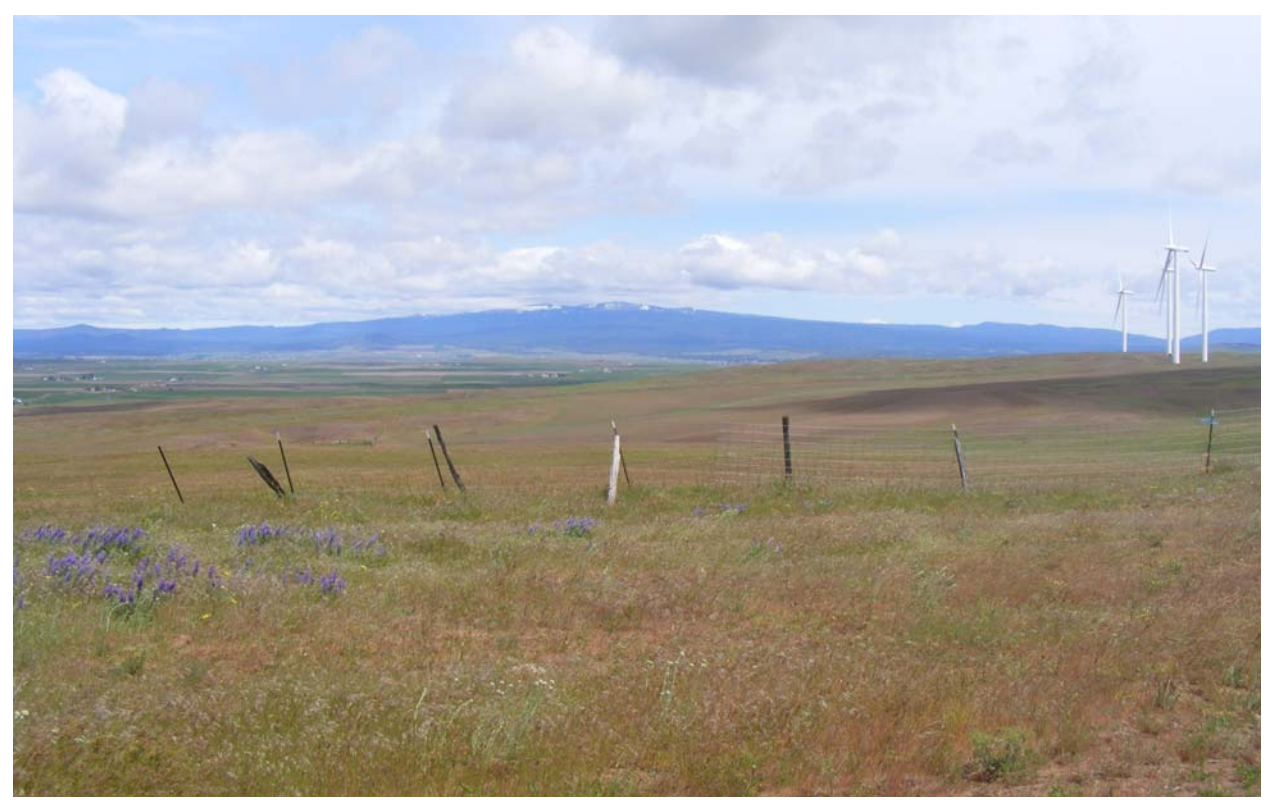
Figure 2-27. View from Cameron Road (near E17, looking east)