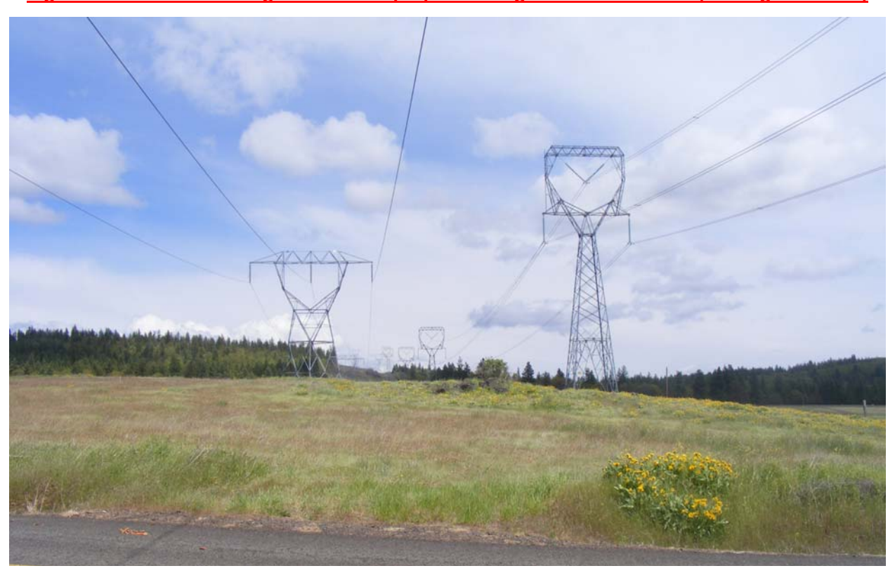
Figure 2-31. View from intersection of Erickson Road and Dalles Mountain Road (near M13, looking south)