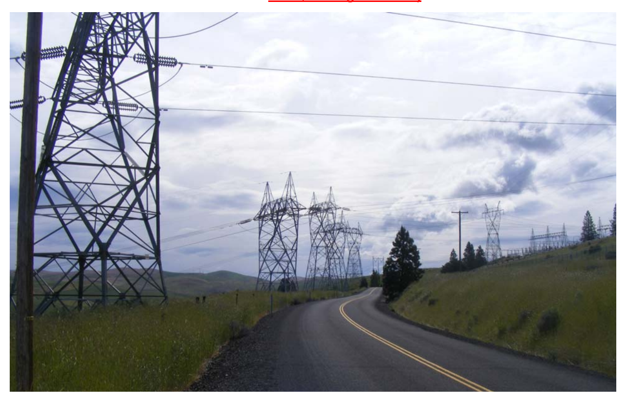
Figure 2-23. View along Fifteen Mile Road (near E3/M3, looking northeast)