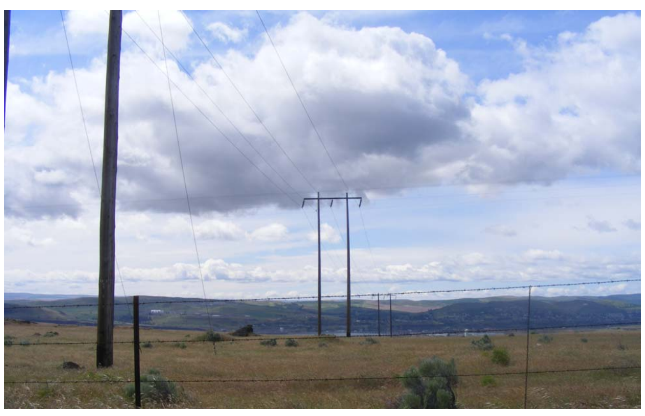
Figure 2-34. View from Washington SR 14 (near W4, looking south)