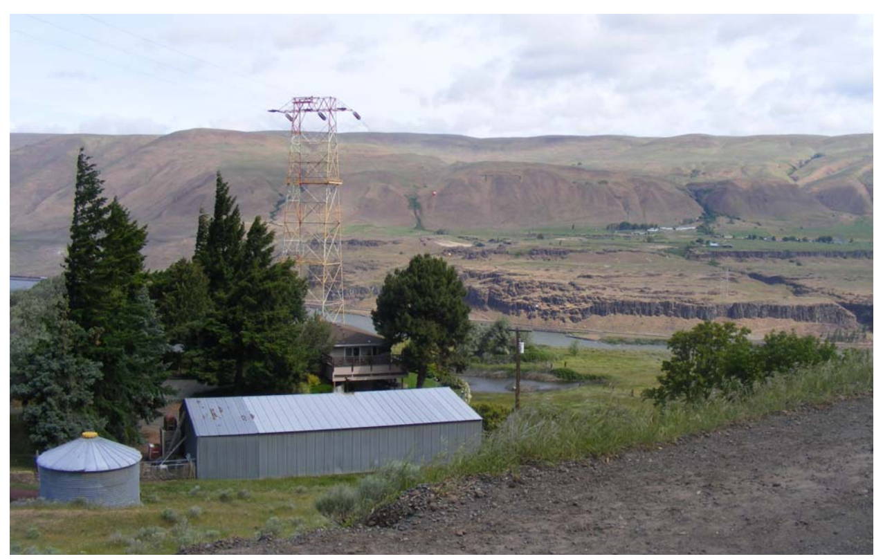
Figure 2-24. View along Moody Road (near E7/M7, looking north)