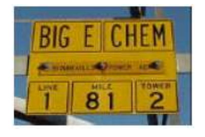
PS2 1-2-A BPA Structure Identification

BIG E – CHEM 1-81-2 BPA Structure Identification